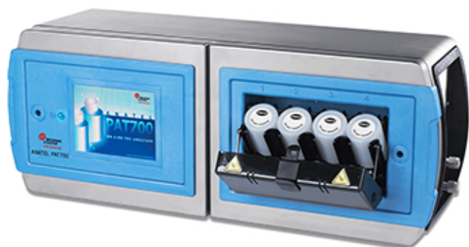
Anatel PAT700 On-Line TOC analyzer and QbD1200 Bench-Top Lab TOC Analyzer