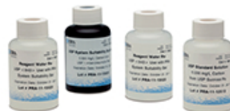
Certified Reference Materials and Proficiency Testing products